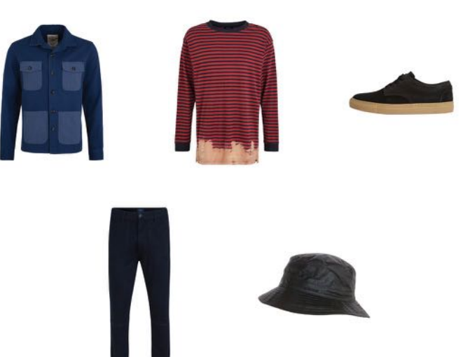
jacket Resteröds, longsleeve Diesel, sneakers Wood wood, trousers Edwin, hat Barbour